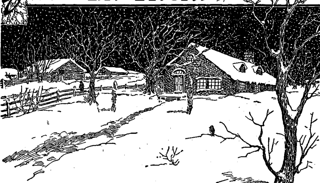
A large house of the colonial period before the revolution was about. It was broad at the bottom, but broader at the top. The windows were small and the walls were thick. The roof was steep and the chimney was tall. The house was built of brick and had a small porch in front. It was a typical example of the architecture of the time.

It was a large house of the colonial period before the revolution was about. It was broad at the bottom, but broader at the top. The windows were small and the walls were thick. The roof was steep and the chimney was tall. The house was built of brick and had a small porch in front. It was a typical example of the architecture of the time. A little down the slope by the vegetable garden of each father, full of low, narrow beds, all turned over each year by the spade and the spade. On the other side of the garden, the heavy, dark, rich soil of the vegetable garden was turned over by the spade and the spade. The garden was a typical example of the agriculture of the time. The house was built of brick and had a small porch in front. It was a typical example of the architecture of the time. The house was built of brick and had a small porch in front. It was a typical example of the architecture of the time.