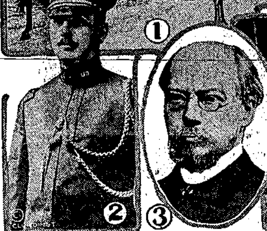
1—American troops in France unloading machine guns...