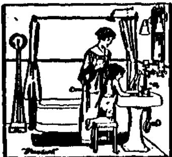
JAS. McLAUGHLIN MODERN PLUMBING

Auto Repair Work Our Delight Star Building 3 & 5 S. Second St.