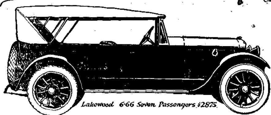
Lakewood 6-66 Seven Passengers $2875.

206 - 208 Bellevue Avenue Hammonton, N. J.