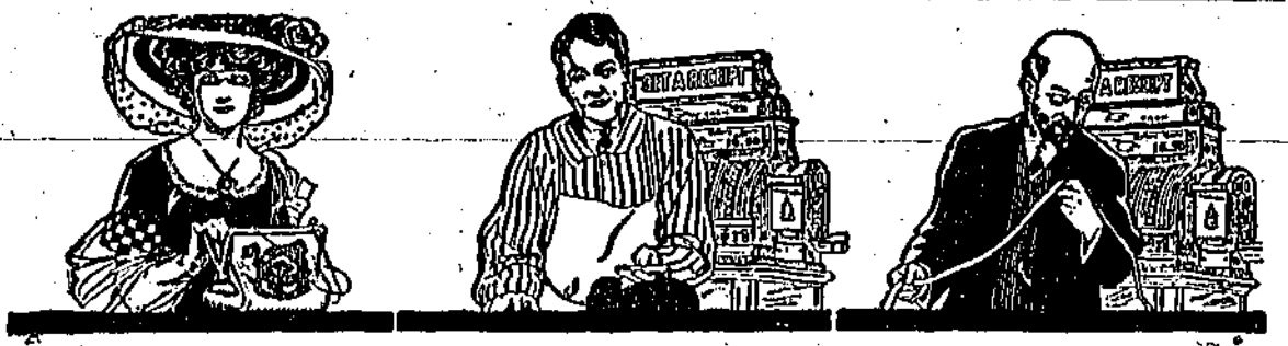
The Woman behind the Pocketbook—the Clerk behind the Counter—and the Man behind the Business.