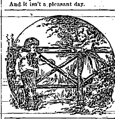
Ab. deary me! Why can't they agree,

And-never-a-neighbor's-word they-say-But they don't seem happy-I wonder big manufacturing company said sev-