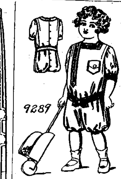
9289. A COMPORTABLIS "PLAY" GARMENT

The busy housewife, or the woman who has little duties to perform about the house, well knows the value of a protective work apron such as the one here shown. The making is a very simple matter (as will be seen it a glance) and may be easily and readily accomplished. Generous pockets re attached to the skirt and the sleeves are full enough to accommodate e dress sleeve worn underneath. Linen, gingham and percale are all suitable for the making. The pattorn is cut in 3 sizes: Small, medium and It requires 41-2 yards of 36-inch material for the medium size, A pattern of this illustration mailed to any address on recoipt of conts in silver or stamps.