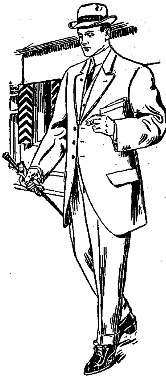
Copyrights Hart Schaffner & Marx

Merchandise manufactured by the best Experts in the business. Second, Real service; in other words, ability to put the right thing on you, the suit that has your fit, your style, the one that dresses you in taste.