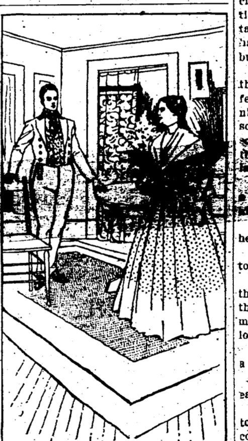
When Pa rose up with the courage of a lion.

You see, there wasn't no such fuss about getting married in those days. When a young man and woman that had been keeping company made up their minds to get married, there wasn't no publication in papers. Rite down-right improper. It would have been thought, but I suppose nowadays that young men are so slippery young women has to give notice when they take a mortgage on them.