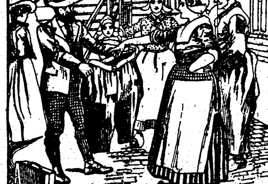
AN INTERESTING SCENE IN HOLLAND.

Art of Keeping a Secret. PERSONS that can keep a secret are few. A secret seems to give most people a cold.