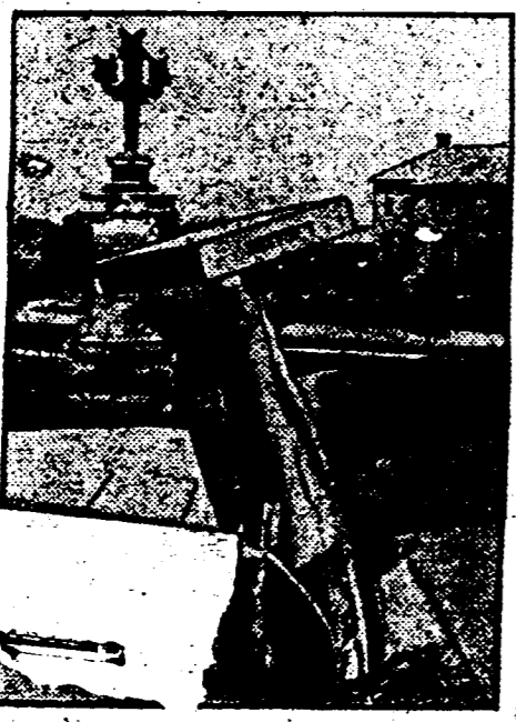
STATUE OF AGASSIZ AT PALO ALTO.

There were some almost comic incidents associated with the tragic affair at San Francisco, and this is one photographed in the Stanford University grounds at Palo Alto.