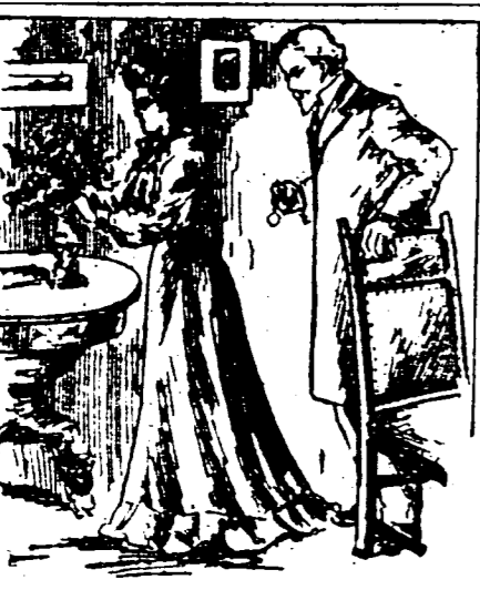
"OH, YES, I SHALL BE HAPPY."

"Yes, I shall marry Captain Tenby now," she said unhesitatingly. "He spoke last night, and I—"