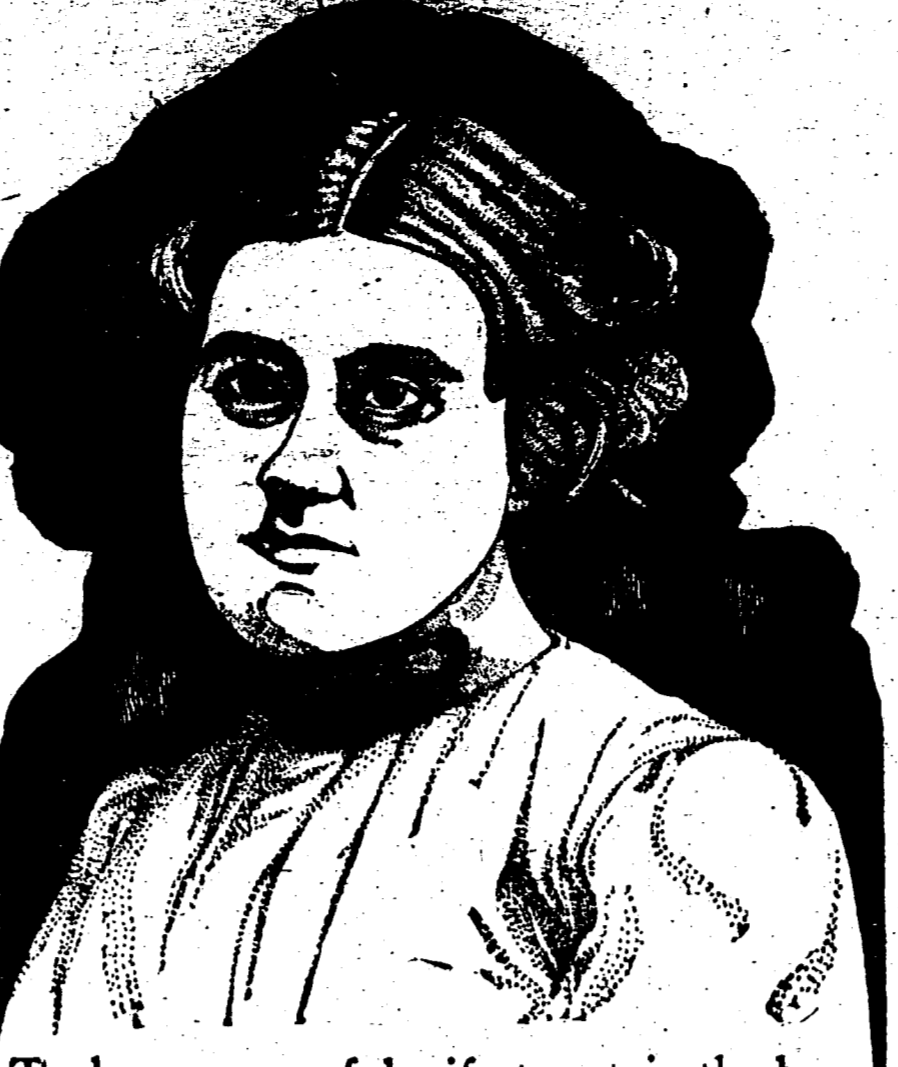
To be a successful wife, to retain the love and admiration of her husband should be a woman's constant study.