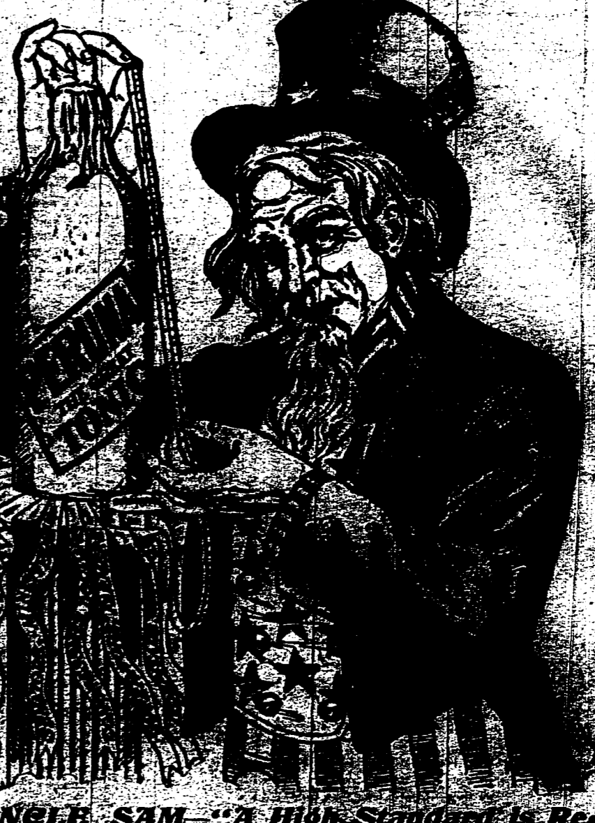
UNCLE SAM—'A High Standard is Required of Any Catarrh Remedy That Has Been Endorsed by so Many Trustworthy and Respected People.'