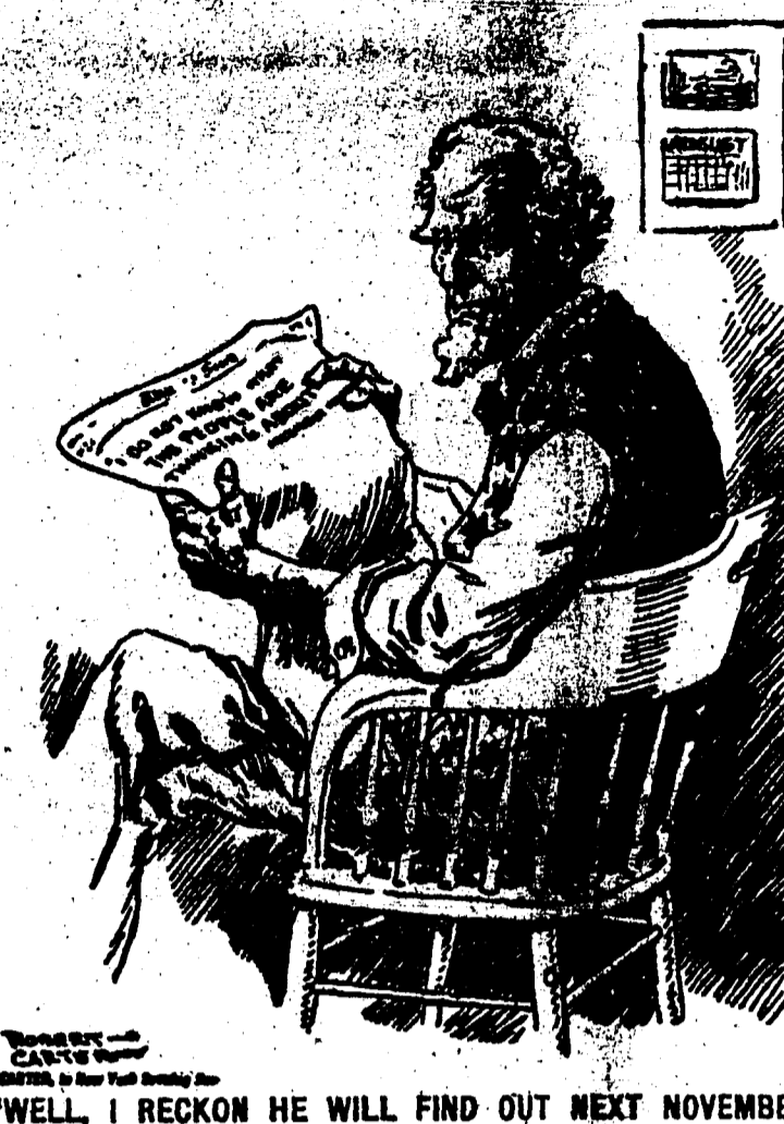
"WELL, I RECKON HE WILL FIND OUT NEXT NOVEMBER!"

Immediate work will begin clearing ground for a temporary proving ground for small arms for the Bethlehem Steel Company, pending the completion of plans for the permanent plant to be established.